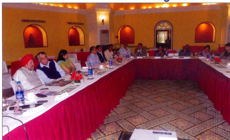
Donors' and Decision Makers' Meet, New Delhi

With the objective of identifying gaps in skills approaches and to derive strategies for reaching the unreached youth, a one-day Donors' and Decision Makers' Meet was organised at New Delhi on 15 March inviting key players and stakeholders from the field of skill development. A Member of Parliament and 21 participants from ILO, MSME, NIOS, World Bank, NIESBUD, SDTT, GIZ, DGET, Don Bosco, IGSSS, Caritas India, WaterAid, UNICEF, Skill-share International and National NGOs attended.