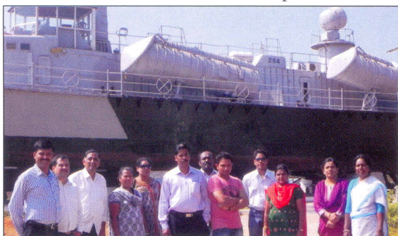
Staff Education Tour - Karwar

FVTRS staff visited Mangalore, Udupi and Karwar in Karnataka on 1-3 February on their annual education tour. Team participated in the closing ceremony of tailoring and driving courses run by KDDC at Karwar and attended certificate distribution programme in one of the projects of KDDC. Met and interacted with few successful trainees who have started their enterprises.