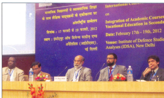
NIOS International Conference, New Delhi