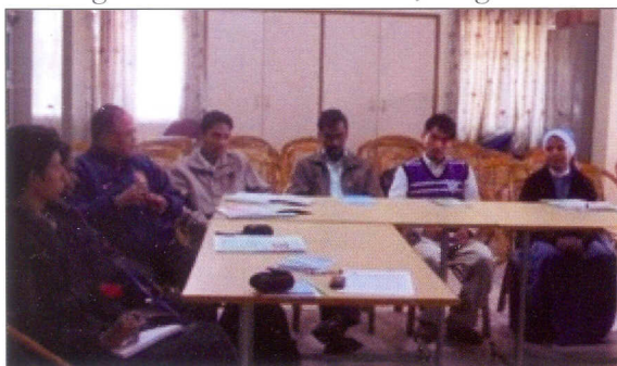
Participants At The Session

A one-day Project Implementation Plan (PIP) meeting for new service-provider organisations in eastern region was organised at Guwahati, Assam on 5 January. Eleven participants from six service-provider organisations from Assam and Manipur attended. The objective of the meeting was to acquaint them with reporting procedures of FVTRS. During the sessions the usage of various formats as well as communication procedures were explained in detail. On 20 February a similar PIP meeting was conducted at FVTRS, Bangalore.