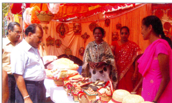
Chief Guest at Market Fair