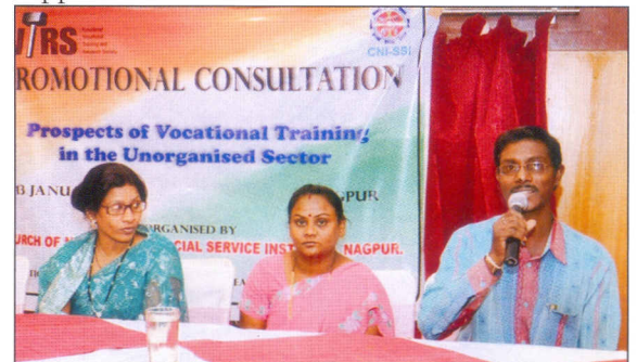
Experience Sharing By Trainees