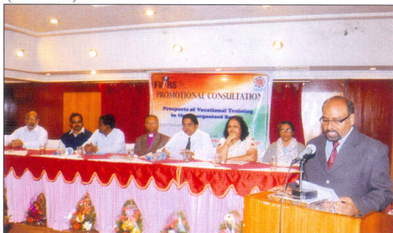
Nagpur Promotional Consultation

A promotional consultation was organised at Nagpur, Maharashtra on 13 January which deliberated on 'Prospects of vocational training in the unorganised sector' with the purpose to sensitise willing prospective doers to educate on skills training parameters and make them as sustainable practitioners in VT. It was organised by the Church of North India-Social Service Institute (CNISSI).