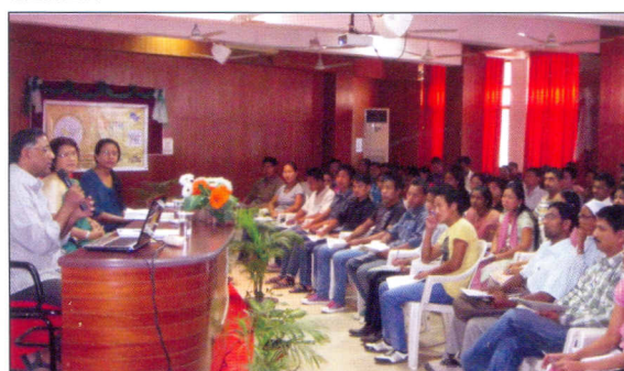
Inaugural Session - Youth Convention