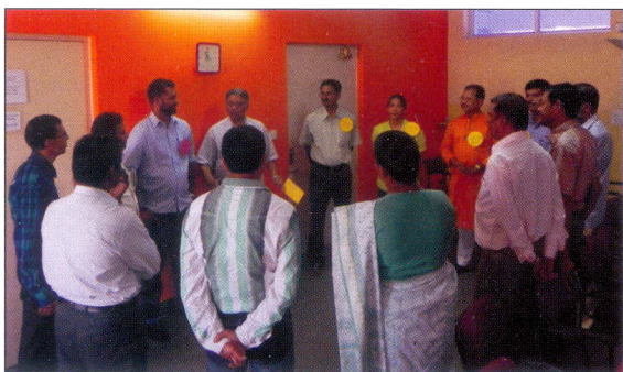
Participants during group exercise

Methodology used was of collaborative and participatory processes based on mutual sharing, reflection, analysis and conceptualisation. Small group discussions were held to understand the meaning of capacity building in the context of developmental sector, critical needs in capacity building to contextualise while setting priorities. The group came up with the prioritised list for capacity building training at various levels like organisation head, project coordinator and other support staff of partner-organisations and at cluster level. Areas of training identified are of management aspects; organisational, project, training and environment partnership management. The exercise will continue with the selected partners to strengthen the project implementation.